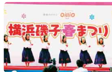
Isogo Spring Festival

Twice a year, the Yokohama Isogo Plant holds an event on its premises to enhance communication with local residents. One of these is the Isogo Spring Festival, which was held for the 26th time in 2007. Every year about 15,000 people attend the festival, now a firm date on the local calendar.