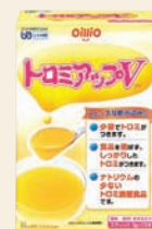
Toromi Up-V (thickens liquids for people with difficulty swallowing)