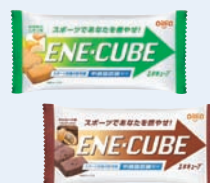
ENE-CUBE (honey lemon and chocolate flavors)